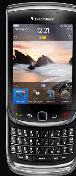
BlackBerry® Torch™ 9800 smartphone