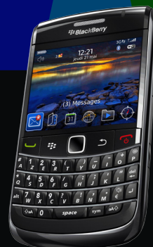
BlackBerry® Bold™ 9700 smartphone