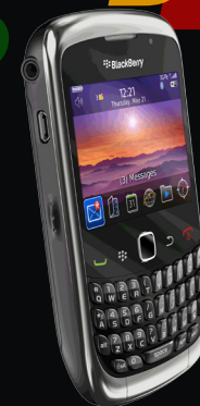
BlackBerry® Curve™ 9300 smartphone