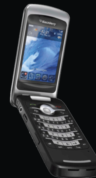
BlackBerry® Pearl Flip™ 8220 smartphone

BlackBerry® smartphones available from as little as £99 For further details please visit our Customer Services Centre.