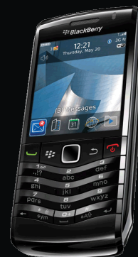
BlackBerry® Pearl™ 9105 smartphone